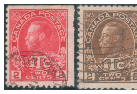
Issued 29th Aug. 1916

During WWI, many countries added a war-tax Issued 1st Ian. 1916 surcharge for